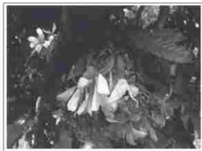
Figure 14.3 : Humboldtia decurrens Bedd — highly rare endemic tree of Southern Western Ghats (India)

There is an urgent need to educate people to adopt environment-friendly practices and reorient their activities in such a way that our development is harmonious with other life forms and is sustainable. There is an increasing consciousness of the fact that such conservation with sustainable use is possible only with the involvement and cooperation of local communities and individuals. For this, the development of institutional structures at local levels is necessary. The critical problem is not merely the conservation of species nor the habitat but the continuation of process of conservation.