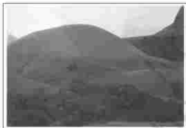
Figure 14.1 : Grasslands and sholas in Indira Gandhi National Park, Annamalai, Western Ghats — an example of ecosystem diversity

You have studied about the ecosystem in the earlier chapter. The broad differences between ecosystem types and the diversity of habitats and ecological processes occurring within each ecosystem type constitute the ecosystem diversity. The 'boundaries' of communities (associations of species) and ecosystems are not very rigidly defined. Thus, the demarcation of ecosystem boundaries is difficult and complex.