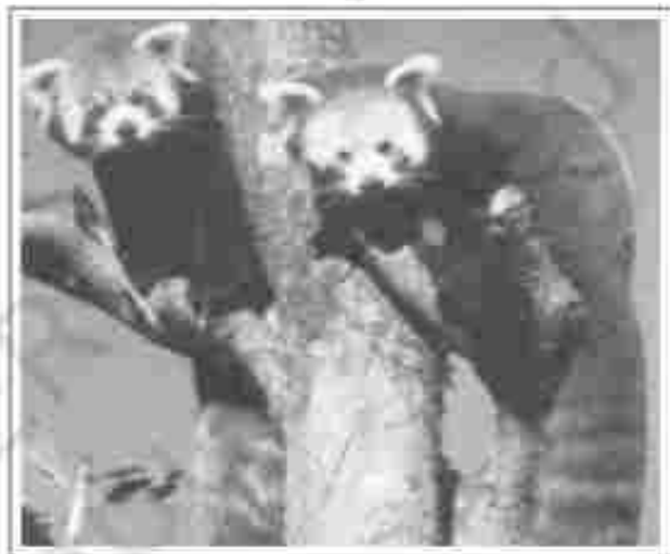
Figure 14.2 : Red Panda — an endangered species

It includes those species which are in danger of extinction. The IUCN publishes information about endangered species world-wide as the Red List of threatened species: